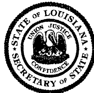
Secretary of State 34984116D