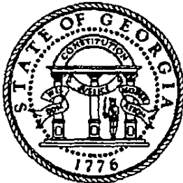
Karen C Handel Secretary of State

WITNESS my hand and official seal in the City of Atlanta and the State of Georgia on June 12, 2009