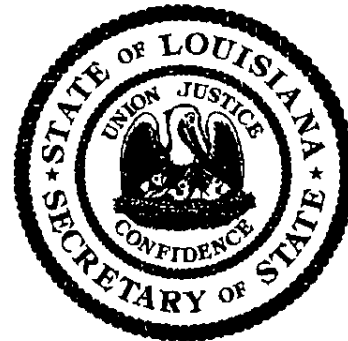
Secretary of State 36900328D