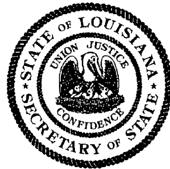
Secretary of State 36712136D

In testimony whereof, I have hereunto set My hand and caused the Seal of my Office To be affixed at the City of Baton Rouge on, August 7, 2009