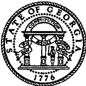
Karen C Handel Secretary of State

This certificate is issued pursuant to Title 14 of the Official Code of Georgia Annotated and is prima-facie evidence that said entity is in existence or is authorized to transact business in this state.