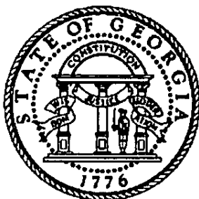
Karen C Handel Secretary of State

WITNESS my hand and official seal in the City of Atlanta and the State of Georgia on December 9, 2008