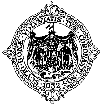
Paul B. Anderson Charter Division

301 West Preston Street, Baltimore, Maryland 21201 Telephone Balto. Metro (410) 767-1344 / Outside Balto. Metro (888) 246-5941 0005630886 MRS (Maryland Relay Service) (800) 735-2258 TT/Voice Fax (410) 333-7097