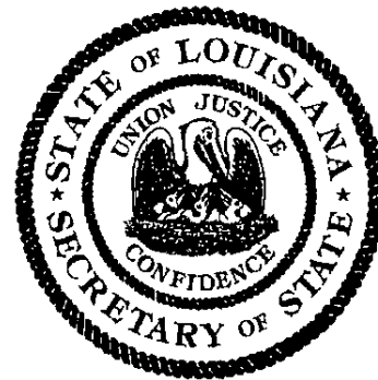
Secretary of State 27914790D

In testimony whereof, I have hereunto set My hand and caused the Seal of my Office To be affixed at the City of Baton Rouge on, November 26, 2008