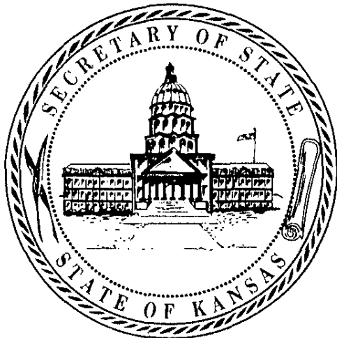
RON THORNBURGH SECRETARY OF STATE

I hereto set my hand and cause to be affixed my official seal. Done at the City of Topeka, this 14 th day of December, A.D. 2009