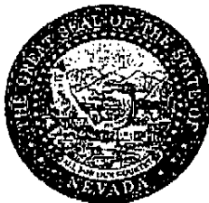
[Signature] ROSS MILLER Secretary of State

IN WITNESS WHEREOF, I have hereunto set my hand and affixed the Great Seal of State, at my office on September 4, 2008.