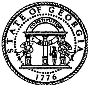
Karen C Handel Secretary of State

This certificate is issued pursuant to Title 14 of the Official Code of Georgia Annotated and is prima-facie evidence that said entity is in existence or is authorized to transact business in this state.