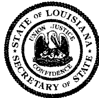
Secretary of State 36790641N

In testimony whereof, I have hereunto set My hand and caused the Seal of my Office To be affixed at the City of Baton Rouge on, July 15, 2008