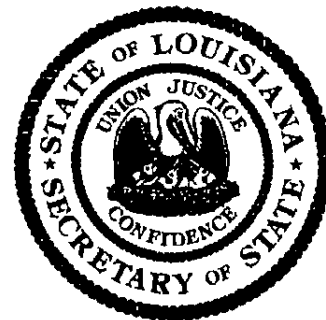
Secretary of State 36049873D