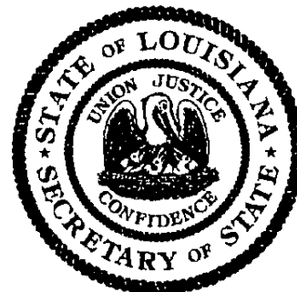
Secretary of State 33449450D