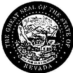
ROSS MILLER Secretary of State

Electronic Certificate Certificate Number: C20080611-1101 You may verify this electronic certificate online at http://secretaryofstate.biz/