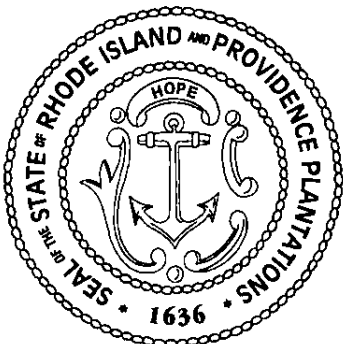
Secretary of State

SIGNED AND SEALED, this fifteenth day of April, A.D., 2008.