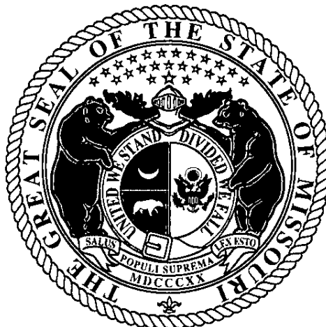
Secretary of State

Certification Number: 10458997-1 Reference: de