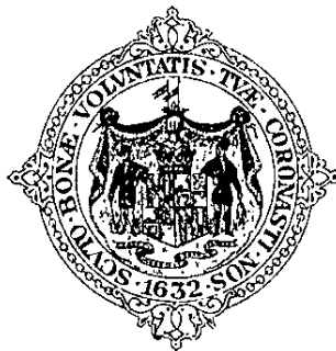
Paul B. Anderson Charter Division

301 West Preston Street, Baltimore, Maryland 21201 Telephone Balto. Metro (410) 767-1340 / Outside Balto. Metro (888) 246-5941 MRS (Maryland Relay Service) (800) 735-2258 TT/Voice Fax (410) 333-7097