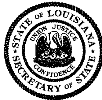
Secretary of State 29123180D