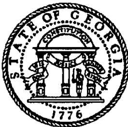
Karen C Handel Secretary of State

WITNESS my hand and official seal in the City of Atlanta and the State of Georgia on June 25, 2009