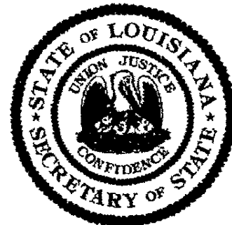
Secretary of State 35751051D

In testimony whereof, I have hereunto set My hand and caused the Seal of my Office To be affixed at the City of Baton Rouge on, September 26, 2007