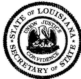
Secretary of State 34395286N

In testimony whereof, I have hereunto set My hand and caused the Seal of my Office To be affixed at the City of Baton Rouge on, October 1, 2007