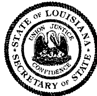
Secretary of State 34692929D