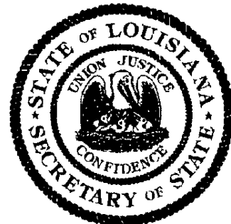
Secretary of State 34573498D