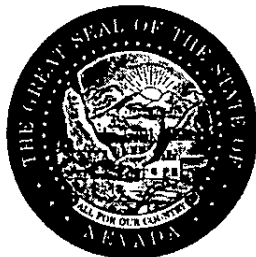
ROSS MILLER Secretary of State

Electronic Certificate Certificate Number: C20070329-1633 You may verify this electronic certificate online at http://secretaryofstate.biz/