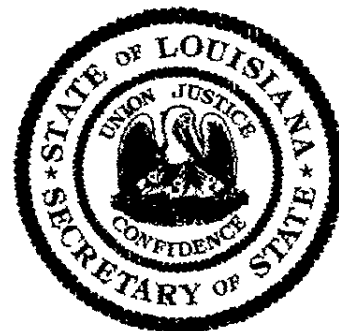
Secretary of State 34480552N

In testimony whereof, I have hereunto set My hand and caused the Seal of my Office To be affixed at the City of Baton Rouge on, January 22, 2007