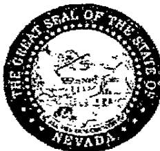
DEAN HELLER Secretary of State

Electronic Certificate Certificate Number: C20061204-2447 You may verify this electronic certificate online at http://secretaryofstate.biz/