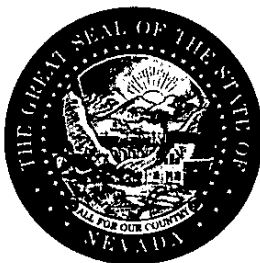
DEAN HELLER Secretary of State

Electronic Certificate Certificate Number: C20061204-2015 You may verify this electronic certificate online at http://secretaryofstate.biz/