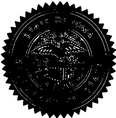
CHESTER J. CULVER SECRETARY OF STATE

I, CHESTER J. CULVER, Secretary of State of the State of Iowa, custodian of the records of incorporations, certify that the corporation named on this certificate is in existence and was duly incorporated under the laws of Iowa on the date printed above, that all fees required by the Iowa Business Corporation Act have been paid by the corporation, that the most recent biennial corporate report has been filed by the Secretary of State, and that articles of dissolution have not been filed.