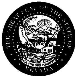
DEAN HELLER Secretary of State

Electronic Certificate Certificate Number: C20061213-3267 You may verify this electronic certificate online at http://secretaryofstate.biz/