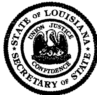
Secretary of State 34459722N