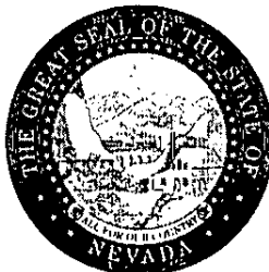
DEAN HELLER Secretary of State

Electronic Certificate Certificate Number: C20061030-2185 You may verify this electronic certificate online at http://secretaryofstate.biz/