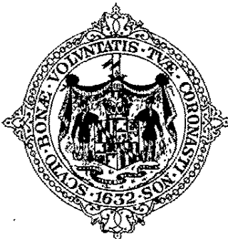
Paul B. Anderson Charter Division

FILED SECRETARY OF STATE DIVISION OF CORPORATIONS 06 NOV 17 AM 11:49