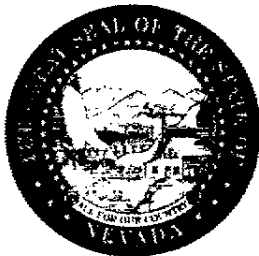
DEAN HELLER Secretary of State

Electronic Certificate Certificate Number: C20061103-2176 You may verify this electronic certificate online at http://secretaryofstate.biz/