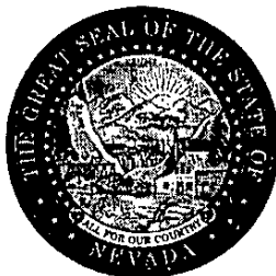
DEAN HELLER Secretary of State

Electronic Certificate Certificate Number: C20061011-2848 You may verify this electronic certificate online at http://secretaryofstate.biz/