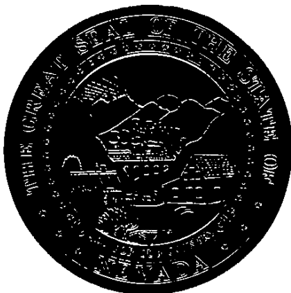
DEAN HELLER Secretary of State

IN WITNESS WHEREOF, I have hereunto set my hand and affixed the Great Seal of State, at my office on September 25, 2006.