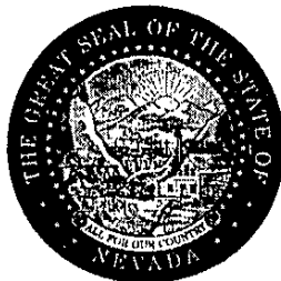
DEAN HELLER Secretary of State

Electronic Certificate Certificate Number: C20061005-0952 You may verify this electronic certificate online at http://secretaryofstate.biz/