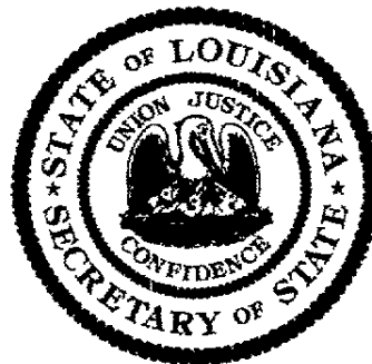
Secretary of State 34569379D

In testimony whereof, I have hereunto set My hand and caused the Seal of my Office To be affixed at the City of Baton Rouge on, September 27, 2006