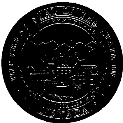
DEAN HELLER Secretary of State

IN WITNESS WHEREOF, I have hereunto set my hand and affixed the Great Seal of State, at my office on July 12, 2006.