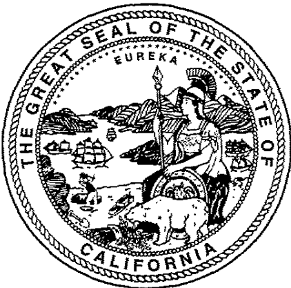
BRUCE McPHERSON Secretary of State

IN WITNESS WHEREOF , I execute this certificate and affix the Great Seal of the State of California this day of July 17, 2006.