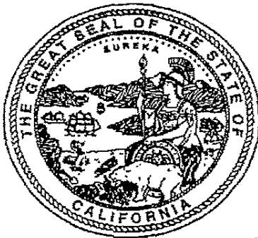
BRUCE McPHERSON Secretary of State

IN WITNESS WHEREOF, I execute this certificate and affix the Great Seal of the State of California this day of July 6, 2006.