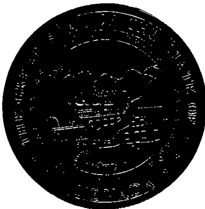
DEAN HELLER Secretary of State

IN WITNESS WHEREOF, I have hereunto set my hand and affixed the Great Seal of State, at my office on June 8, 2006.