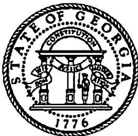
Karen C Handel Secretary of State

Effective May 29, 2009, DATAPATH, INC. , a Georgia Profit Corporation surviving entity filed certificate of merger, merging DOVER MERGER SUB, INC., a Delaware Non-Qualifying entity nonsurviving entity into: DATAPATH, INC., a Georgia Profit Corporation surviving entity changing its name to ROCKWELL COLLINS SATELLITE COMMUNICATIONS SYSTEMS, INC., a Georgia Profit Corporation