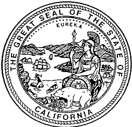
BRUCE McPHERSON Secretary of State

IN WITNESS WHEREOF , I execute this certificate and affix the Great Seal of the State of California this day of October 21, 2005.