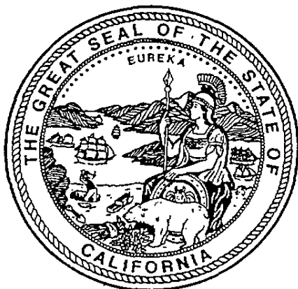
BRUCE McPHERSON Secretary of State

IN WITNESS WHEREOF , I execute this certificate and affix the Great Seal of the State of California this day of October 19, 2005.