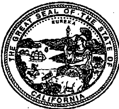
BRUCE McPHERSON Secretary of State

IN WITNESS WHEREOF , I execute this certificate and affix the Great Seal of the State of California this day of October 8, 2005.