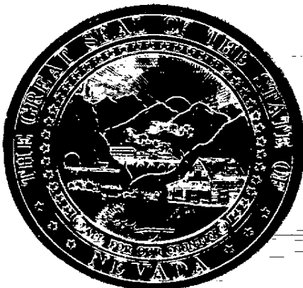
DEAN HELLER Secretary of State

IN WITNESS WHEREOF, I have hereunto set my hand and affixed the Great Seal of State, at my office on August 11, 2005.