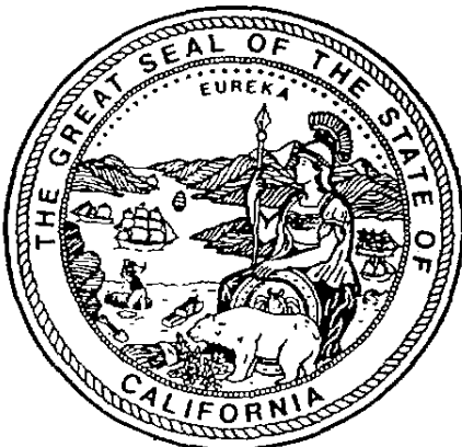
BRUCE McPHERSON Secretary of State

IN WITNESS WHEREOF , I execute this certificate and affix the Great Seal of the State of California this day of August 16, 2005.