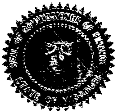
Commissioner of Finance

IN TESTIMONY WHEREOF , I hereunto set my hand and affix the Seal of my office. Done at the City of Jefferson, State of Missouri, on this first day of August, Two Thousand and Five.