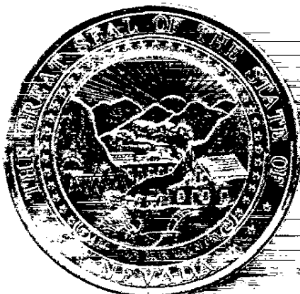
DEAN HELLER Secretary of State

IN WITNESS WHEREOF, I have hereunto set my hand and affixed the Great Seal of State, at my office on May 27, 2005.